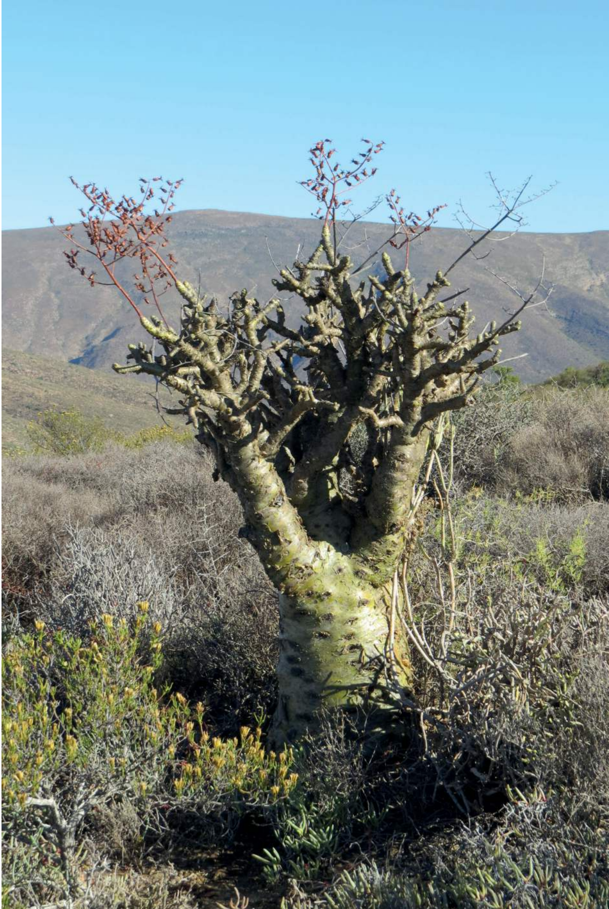
Photograph A for Question 4